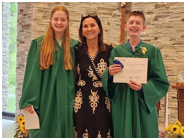
Clockwise from top left: