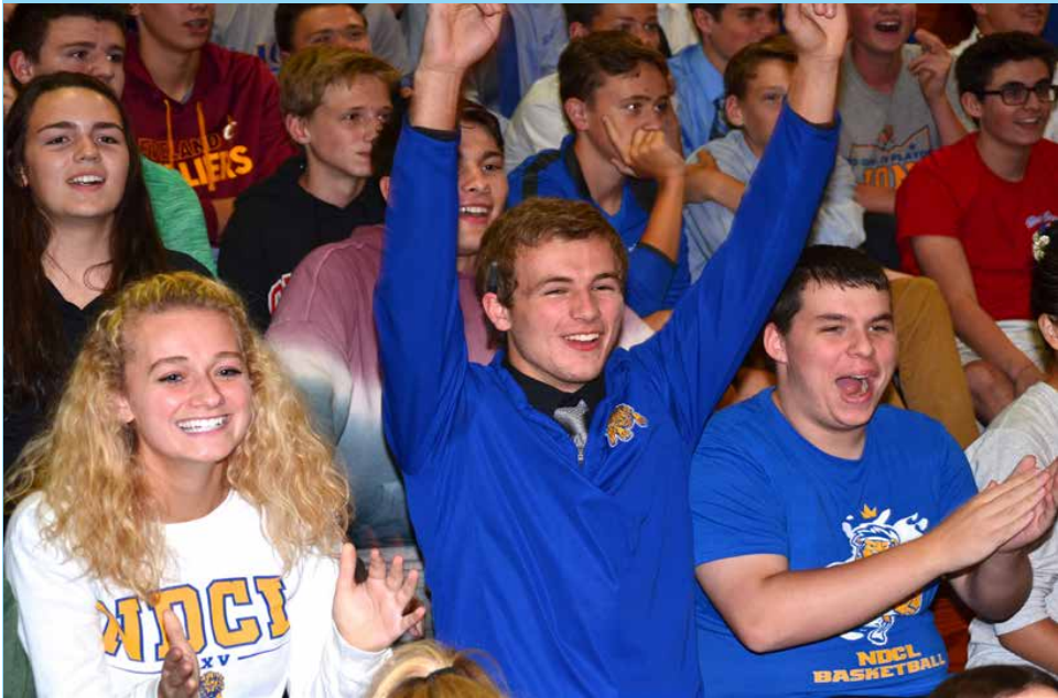
Notre Dame-Cathedral Latin School is one of many SND-sponsored ministries.