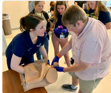
Labor and Delivery