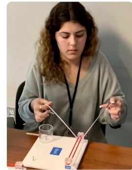
Tying Surgical Knots