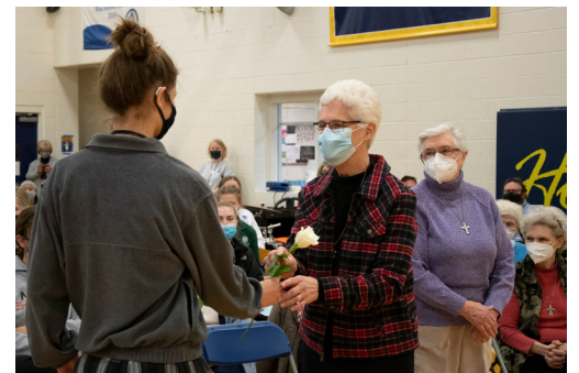
Students at Notre Dame Academy (Park Hills, KY) honored the Sisters of Notre Dame with a rose after an all-school Mass, shown above.

Cardinal Gibbons High School (Raleigh, NC) commemorated Catholic Schools Week with a celebration of Gibbons Alumni serving in Catholic education. Throughout the week, the school profiled 16 alums who graduated from 1984 to 2017 currently working in Virginia, Missouri, Texas, Indiana and North Carolina, including many who teach at Cardinal Gibbons. Participants credit their love of teaching to their supportive and inspiring teachers and coaches at Cardinal Gibbons as well as the positive impact of a Catholic Education. To read the profiles, visit https://www.cgshnc.org/aboutus/communications/news