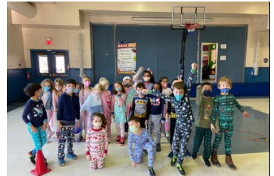
Students at Our Lady of Victory School (Washington, D.C.) enjoyed pajama day, above, during Catholic Schools Week.