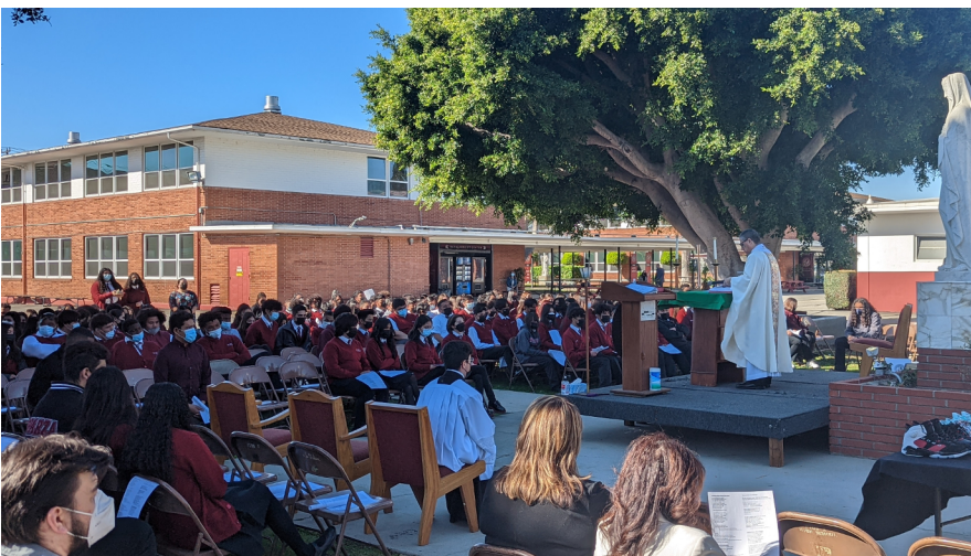
St. Pius X - St. Matthias Academy (Downey, CA) celebrated the week with an all-school Mass, shown above.