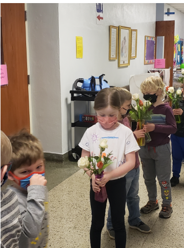
Photo on left: Students at Julie Learning Center (Park Hills, KY) sang songs for and gave flowers to sisters at St. Joseph Heights.

Catholic Sisters Week shines a light on the spirituality, mission, and community building of women religious. SND ministries joyfully celebrated the Sisters of Notre Dame.