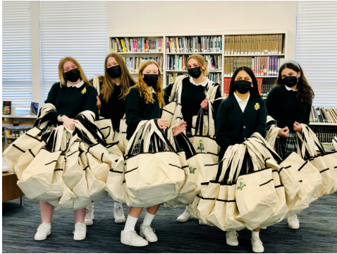
Left photo: Students at La Reina High School & Middle School (Thousand Oaks, CA) put together bags to give to parents at drop off and pick up time to show their appreciation.

Schools across the network celebrated Catholic Schools Week (January 30-February 5) recognizing the importance, value and contributions of a Catholic education to the Church and the world at large.