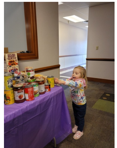
Photo on right: This student of Maria Early Learning Center (Toledo, OH) was eager to help the sisters with their "Stuff the Truck" food drive benefiting the Toledo Seagate Food Bank.

Photo on left: Students at Julie Learning Center (Park Hills, KY) sang songs for and gave flowers to sisters at St. Joseph Heights.